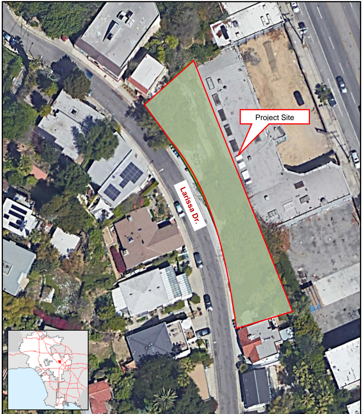
Figure 1. Project Location